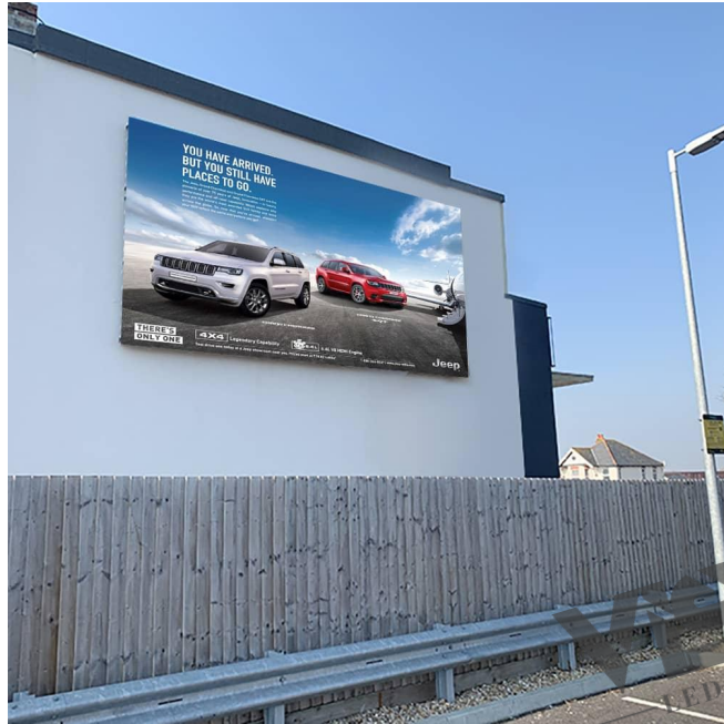
FD series P4 outdoor LED Screen for wall