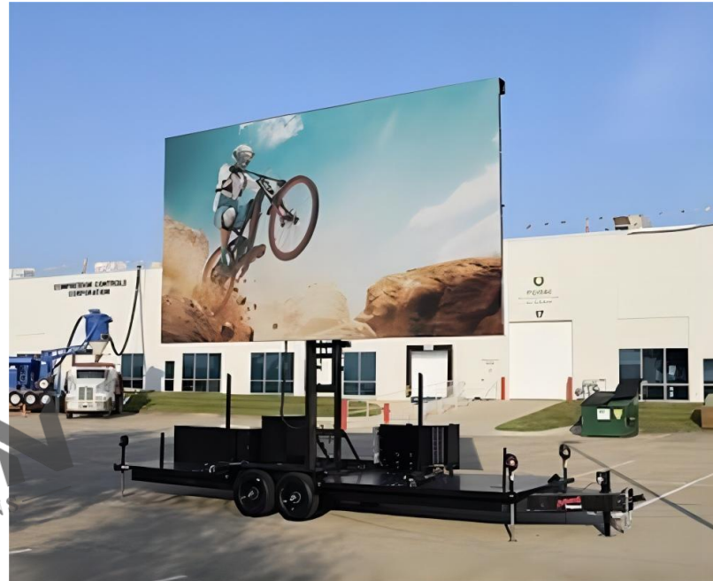
FD series P10 outdoor LED screen for truck