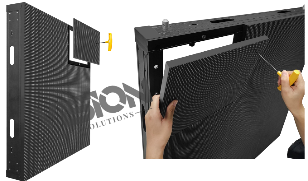
Front maintenance Module